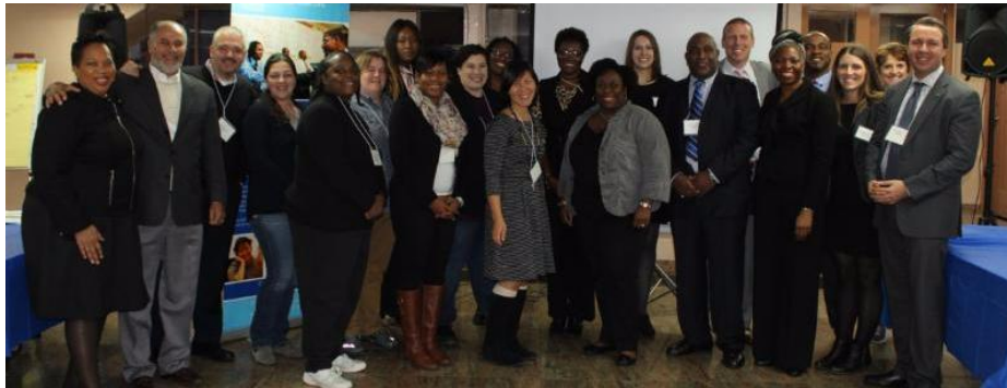
W.K. Kellogg MOVE UP Convening: October 2016

As a leading national workforce organization with locations in 20 cities and growing, STRIVE is proud to actively participate in national conversations regarding closing the skills gap, tackling unemployment, and creating mobility and opportunity for all.