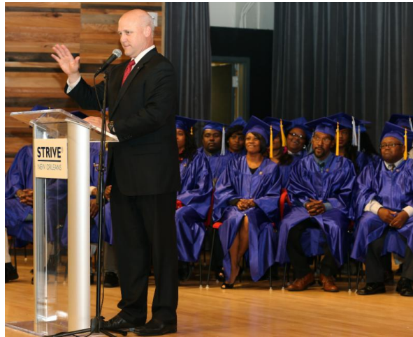
Mayor Landrieu speaks at STRIVE NOLA's December 2015 graduation.

STRIVE New Orleans held five training classes in its inaugural year, graduating more than 100 New Orleanians. Of the many job placements to date, the city's Sewerage and Water Board has already hired 13 STRIVE graduates, with full benefits and pensions. Plans for 2016 include adding a sixth cycle of training.