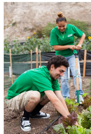
San Diego Participants in STRIVE's National Youth Justice Initiative

Affiliates implementing STRIVE Forward will make use of a new youth Program Manual developed by STRIVE in collaboration with the Youth Development Institute and MDRC , with funding from the Annie E. Casey Foundation. To learn more about the STRIVE youth program, view the presentation delivered by STRIVE International and San Diego Affiliate Second Chance at the California Workforce Association 2016 Youth Conference.