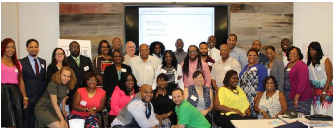
Attendees at the 2015 STRIVE Institute in Philadelphia.

On an ongoing basis, STRIVE provides technical assistance to Affiliates through regular conference calls and webinars on topics such as fund development, data management, employer partnerships, grant management, skills training and national workforce trends. At the local level, STRIVE's Training Task Force recently traveled to New Orleans to support the STRIVE New Orleans team during its first year of programming. All STRIVE Affiliates access STRIVEconnect , STRIVE's online community portal. The STRIVE Affiliate Leadership Council , comprised of Affiliate leaders from across the country, convenes regularly to discuss best practices, set network priorities and align program objectives across sites.