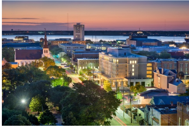
Charleston Cityscape

The STRIVE Network is expanding with the launch of STRIVE Charleston , which will bring STRIVE's programs to South Carolina for the first time. STRIVE Charleston will operate from the Step UP Network , a nonprofit working to improve economic opportunity for individuals living within the state's Tri-County region.